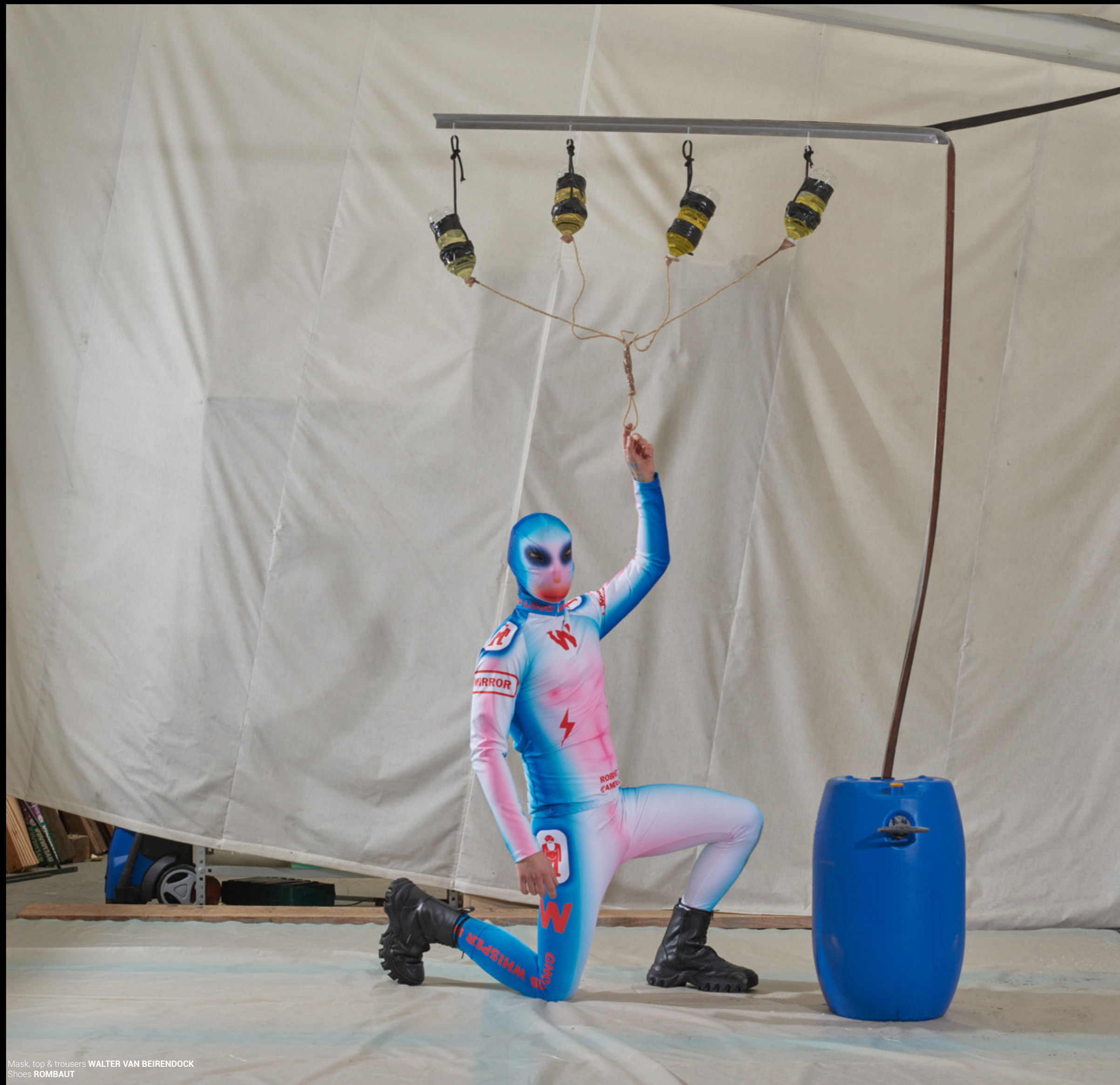
Mask, top & trousers WALTER VAN BEIRENDOCK Shoes ROMBAUT