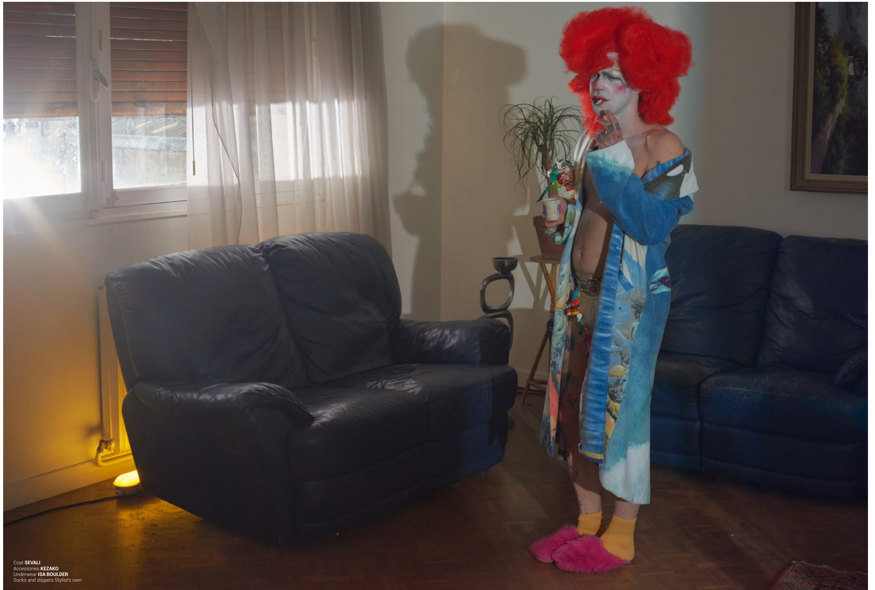
Coat SEVALI Accessories KEZAKO Underwear ISA BOULDER Socks and slippers Stylist's own