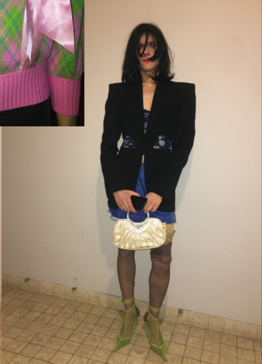
FROM LEFT TO RIGHT Sandals, waist chains, bag & scarf GUCCI Dress Stylist's own Tights & stockings FALKE Shirt KOLOR Latex skirt Stylist's own Shoes ABRA Knit MOTOGO Earrings ALIZEE QUITMAN Shoes & bag Stylist's own Jacket & shoes MUGLER Necklace COLOMBE D'HUMIERES Top, bag & skirt Stylist's own