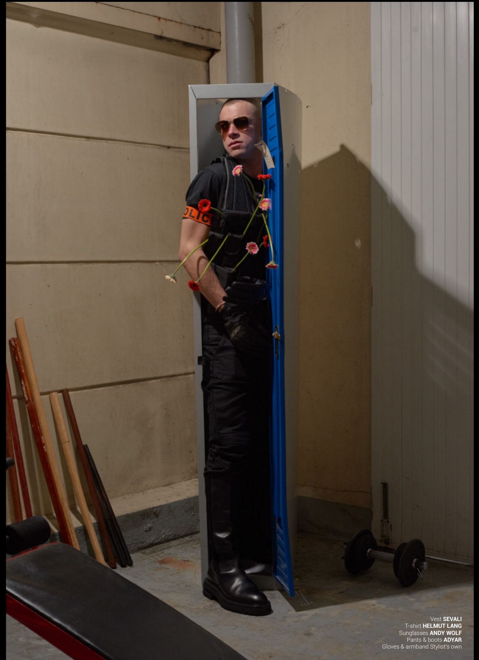
Vest SEVALI T-shirt HELMUT LANG Sunglasses ANDY WOLF Pants & boots ADYAR Gloves & armband Stylist's own